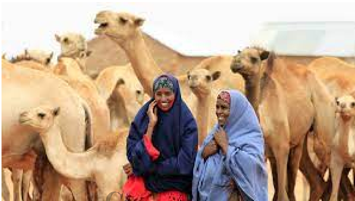
Woman and camel milk in Kenya, Africa. Camel milk could be the next superfoodâ€™ thanks to East Africa