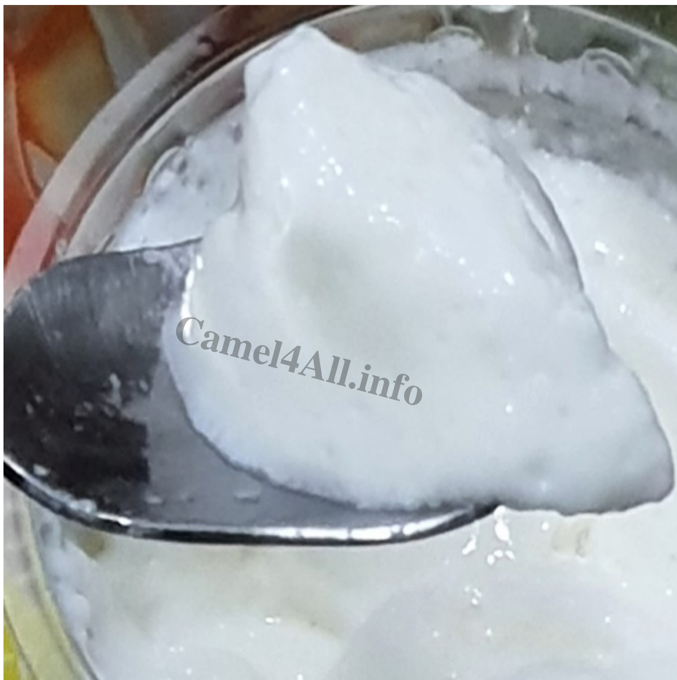
The power of camel milk

It is well documented that CaM is technically more difficult to process into fermented products (such as yogurt) than its counterparts from other livestock. In this regard, appreciable research works have been dealt with many trials in making yogurt from CaM. The manufacturing of yogurt from CaM, however, ended in a texture problem where the final product was not a typical yogurt texture and had an unpleasant taste. Furthermore, the product's viscosity did not change during the gelling process compared to the milk of other dairy species. In other words, the final product is described at best as a drinking yogurt. In fact, such technical difficulties clearly explain the lack of industrial production of CaM yogurt at the present time. https://www.mdpi.com/2076-2615/11/4/1045