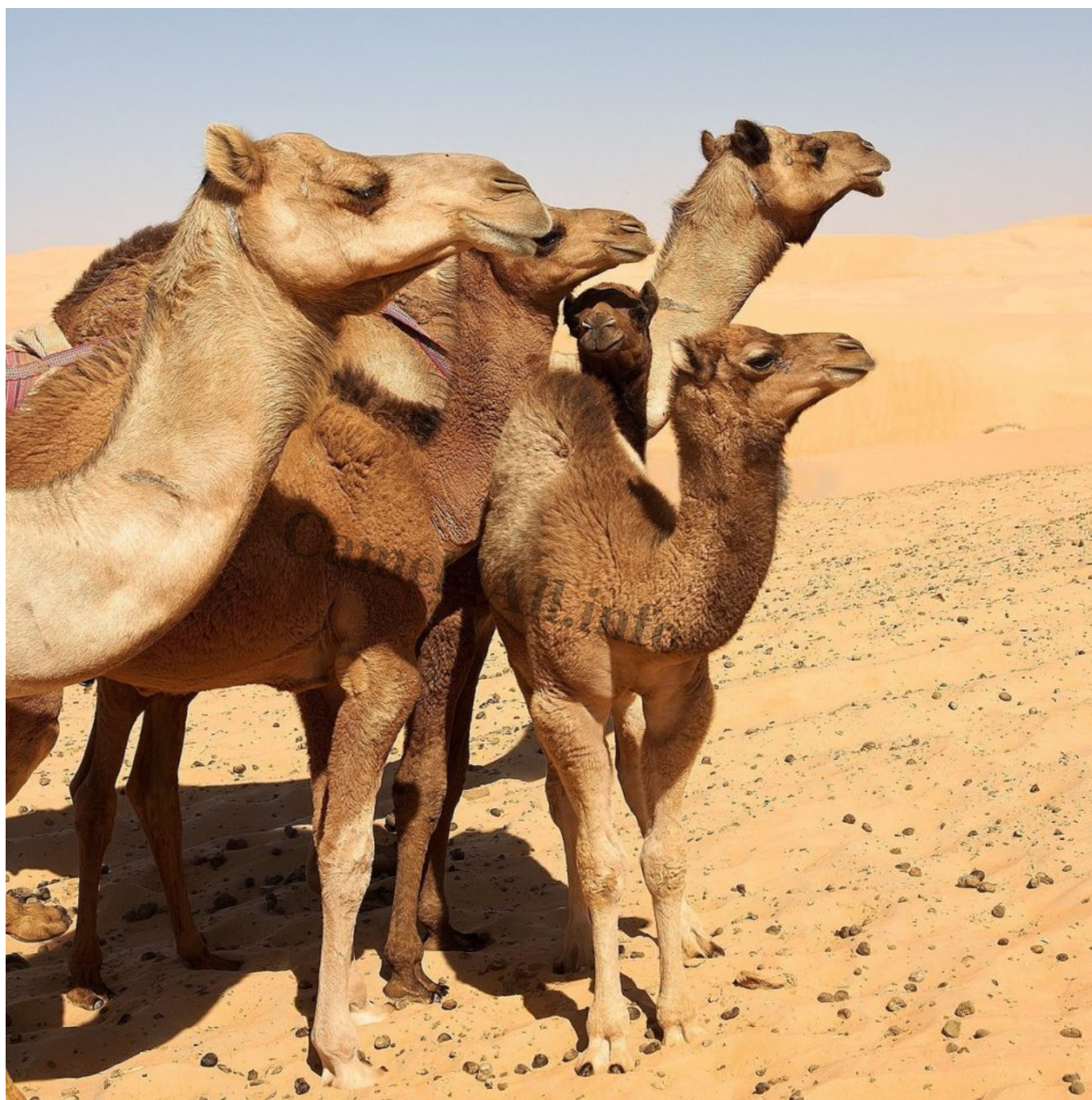
The Beauty of the camels

Recently, yogurt could not be made from CaM unless the dromedary milk samples were fortified with combinations of cow's milk constituents (micellar casein, whey protein, and sodium caseinate) in the presence of microbial transglutaminase. Others added commercial chymosin along with gelatin, starch, and skim milk powder. However, the final product deviated from standards of identity for yogurt traditionally made by acidification (no cheese coagulant) by selected lactic acid bacterial starters. Instead, the resulted CaM fermented product could be best described as a yogurt-like one. https://link.springer-com.sdl.idm.oclc.org/article/10.1007/s40003-020-00535-7