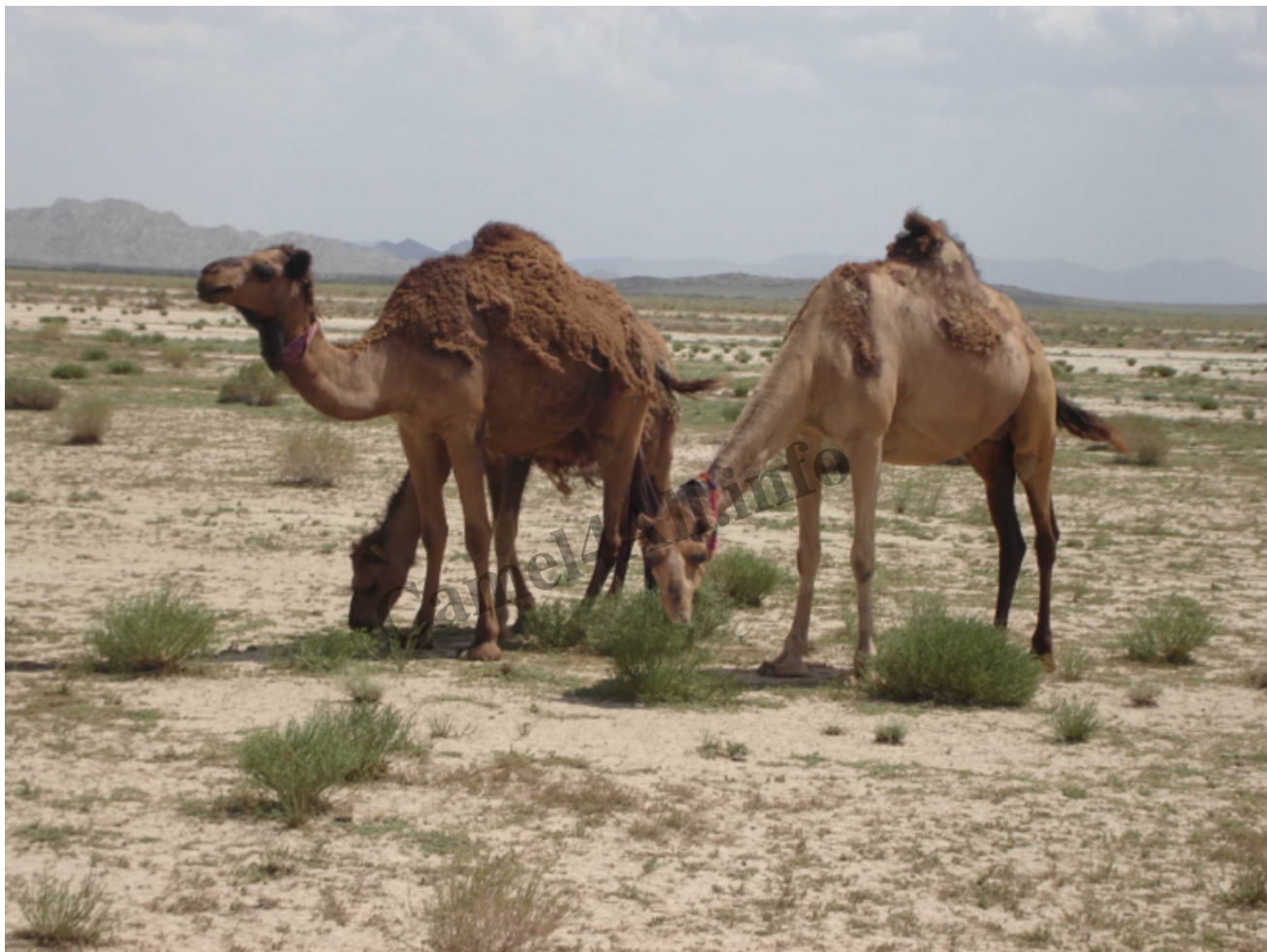
Raigi camel of Kakar Khurasan Zhob region of Pakistan

The author, therefore, proposed a day (22nd June) to think and aware the masses about this precious animal and advocate for the camel to get a proper place again. Our camel advocacy forum CAMEL4LIFE INTERNATIONAL is advocating camels at all available forums, especially for its' incredible milk, which is considered a natural pharmacy.