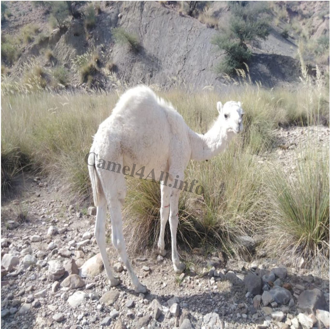
Beautiful male calf of 9 months age.