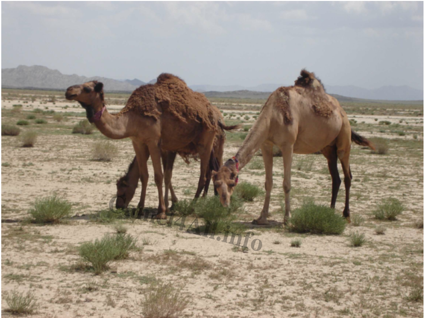
Raigi camel of Kakar Khurasan Zhob region of Pakistan

Thanks to all my camelists friends who supported my camel cause. Iâ€™m happy to see the progress of our forum, many quarters have realized the importance of the camel as a food security animal under the challenging climatic conditions.